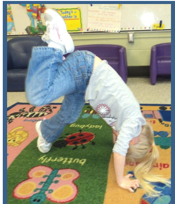
Practicing tumbling in the Bees Room...