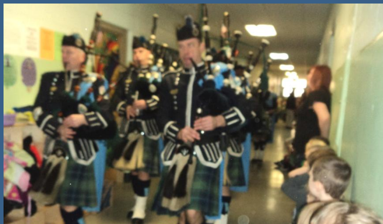
A visit from the Bagpipe Band in honor of St. Patrick's Day